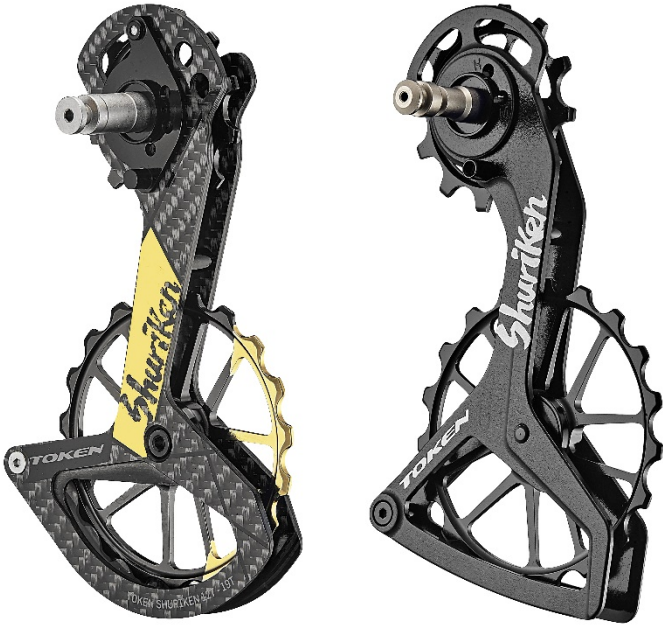
Shuriken Oversized Pulley System TK1729S / TK1729R7