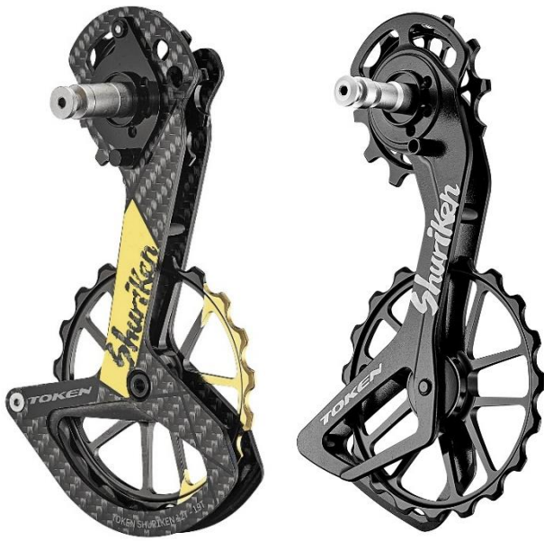
Shuriken Oversized Pulley System TK1729S / TK1729R7